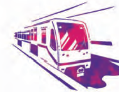
Upcoming Metro Rail